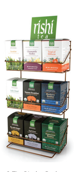
3-Tier Display Rack Item code: PR183