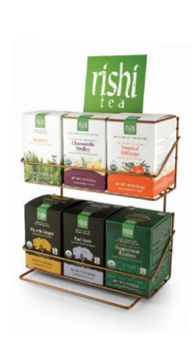
2-Tier Display Rack Item code: PR189