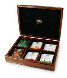
Presentation Box (30 ct; 6 per section) Item code: BX171